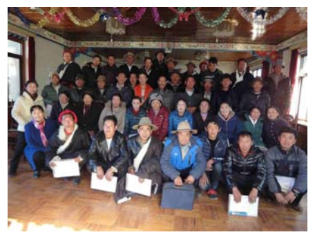
Village doctors and village leaers training (Lhasa)

A training for village doctors and village leaders was organized last month. All village leaders and village doctors from the RCS supported villages were present. It is the aim that the village leaders will transfer their knowledge to inhabitants of their villages, together with the help of the KBDF field technicians.