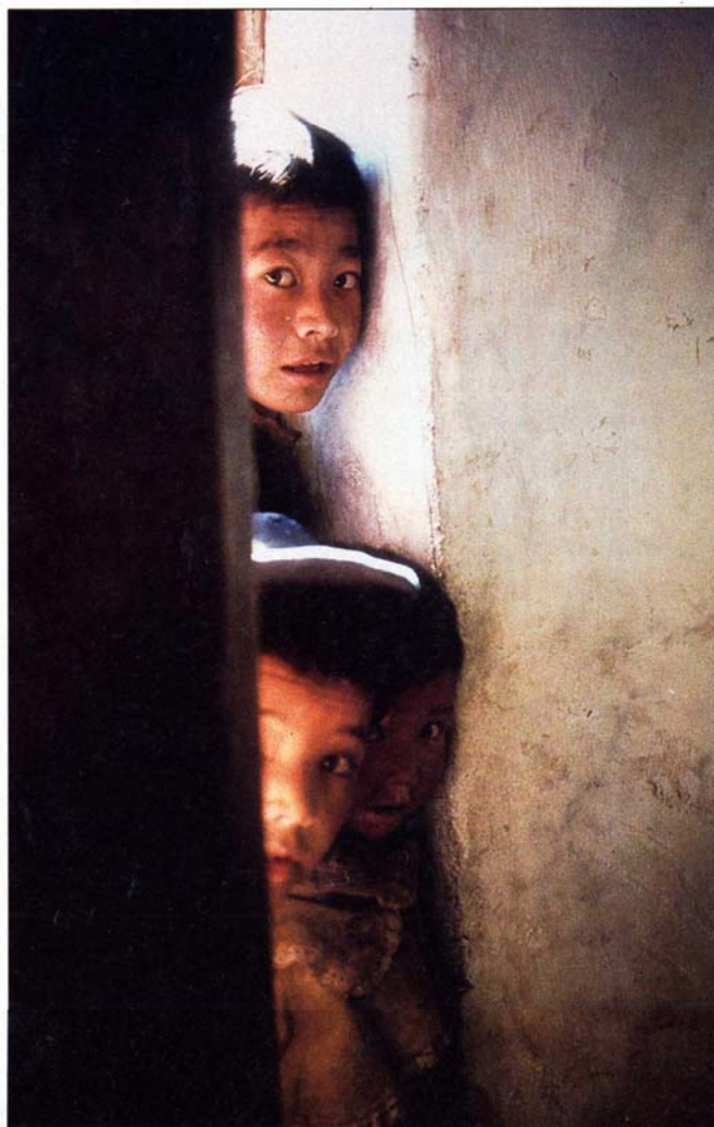
Curious onlookers peek in the door of the outpatient clinics at Lingkang community in central Tibet.

These results present a description of the disease based on the epidemiological survey and the anthropometry of KBD, the clinical features associated with the disease, and the results of