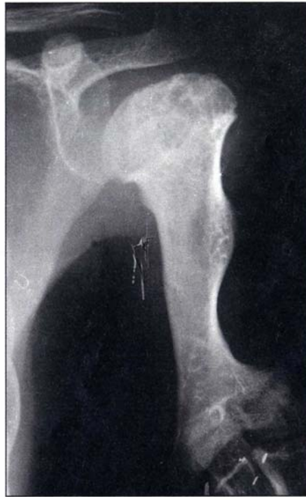
Pictured is a radiograph of the humerus of the same 16-year-old boy.

population in central Tibet is slightly smaller (males = 157 cm +/- 7; females = 146 cm +/- 9) than the normal Tibetan population. In patients older than 20 years, the evolution of the disease is aspecific; the deformed joints undergo an irreversible osteoarthritic degeneration. Advanced cases may result in severe varus or valgus knee deformities.