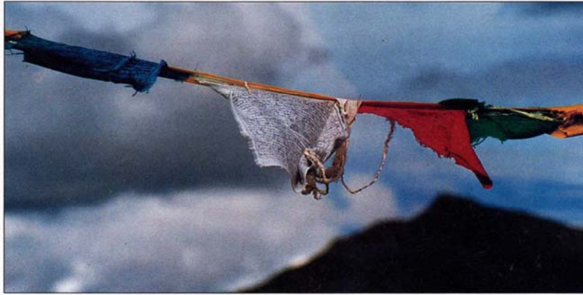
Tibetan prayer flags, also known as "horses of the wind," are flown by residents as a sign of support and hope for residents in need.

Kashin-Beck, from page 4 in humid conditions, which are an ideal culture medium for the fungi.