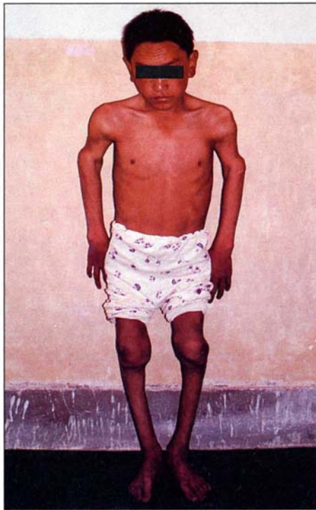
Many patients present with a shortened humerus. Above, a 16-year-old boy with KBD exhibits characteristic knee enlargement and bilateral shortening of the humerus.